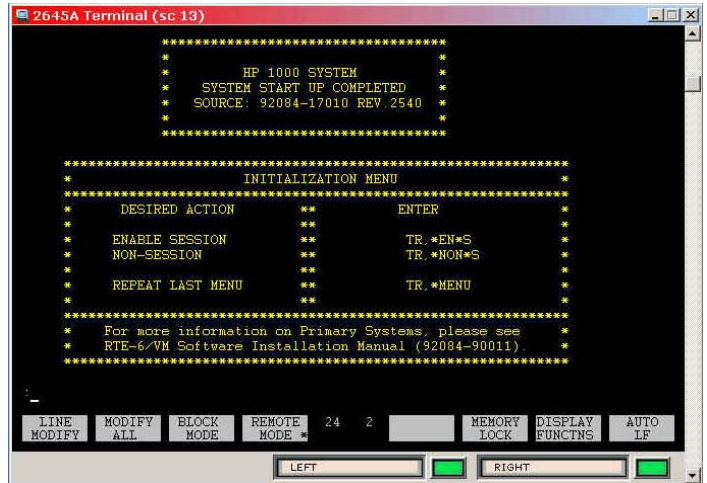
TM-2600 Utility Terminal 2645A Screen with Tape

The BT-1000 Interface simulates all the control switches as a standard HP1000. Point-and-Click on the interface buttons to configure the RTE operating system and run software programs.